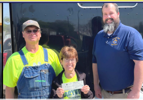
Special Olympics Fish Fry Check