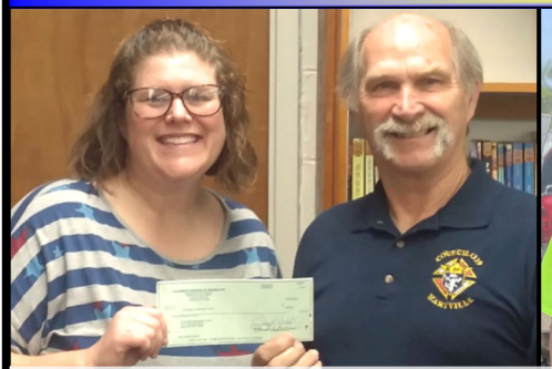
$500 Grant to St. Gregory's School