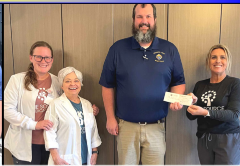
"The Source" Fish Fry Check