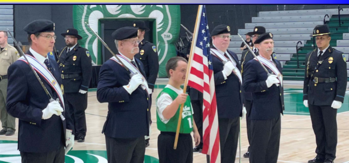
4 th Degree Members welcoming athletes and then providing a Color Guard for the Opening Ceremonies