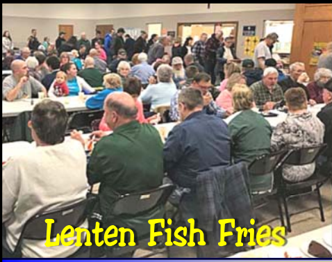
Lenten Fish Fries