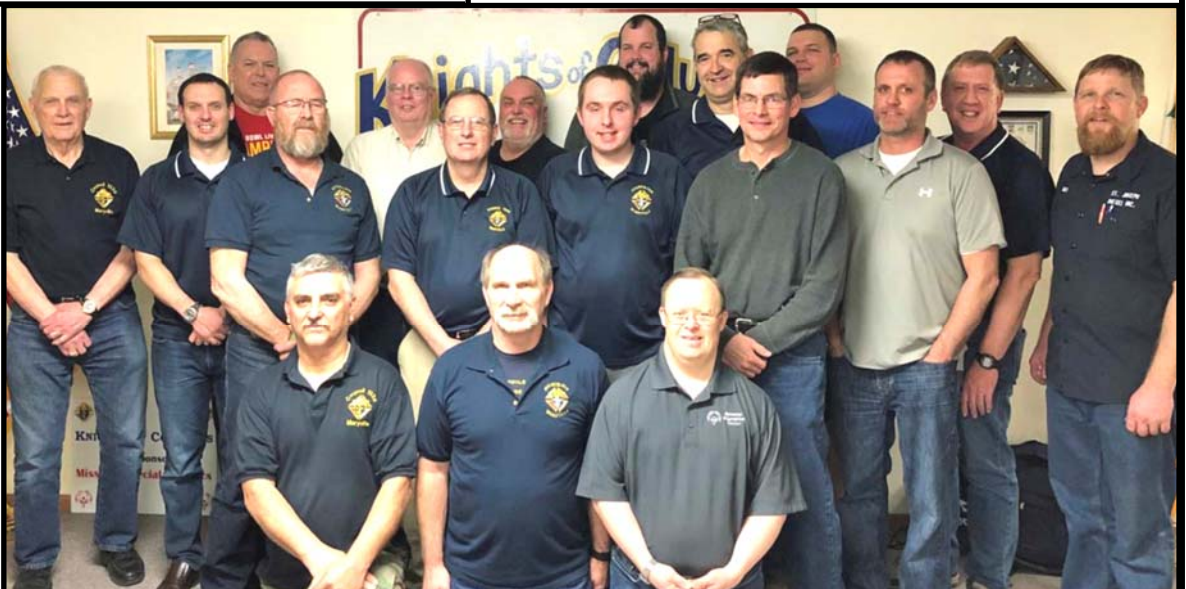
This picture was taken at our March Meeting and will appear in the 2020 Parish Directory