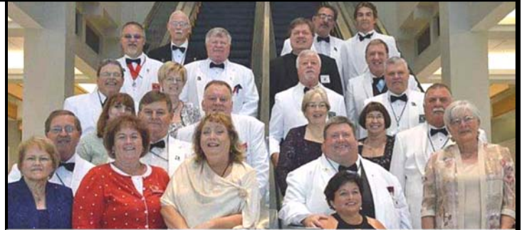
The Missouri Delegation Prior to the States Dinner