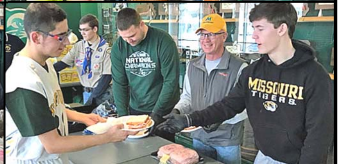
Serving Lunch for Athletes and Coaches at the SOMO Basketball Tournament at Bearcat Arena