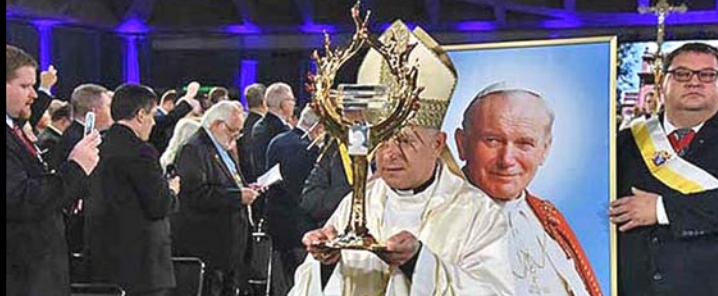
Relics of several saints, including St. Teresa of Calcutta and St. Pope John Paul II were displayed at the Memorial Mass. After Mass they were made available for personal worship.