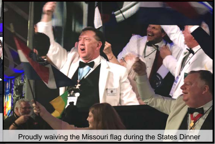
Proudly waving the Missouri flag during the States Dinner