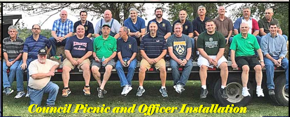
Council Picnic and Officer Installation