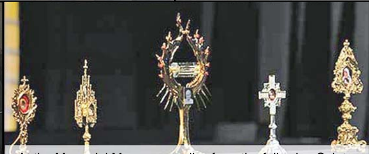
At the Memorial Mass were relics from the following Saints: Louis, Faustina Kowalska, John Paul II, Mexican Martyrs, and Teresa of Calcutta