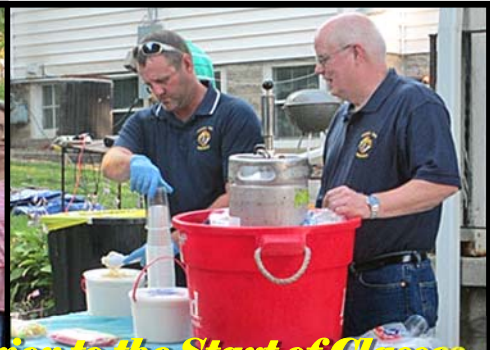
Meal for Newman Center Students on Sunday Prior to the Start of Classes