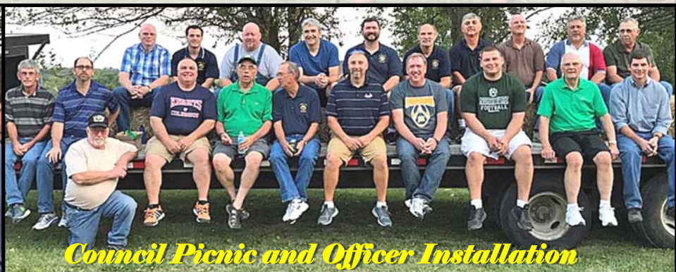
Council Picnic and Officer Installation