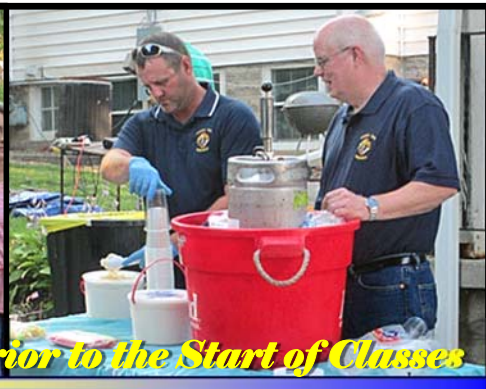
Meal for Newman Center Students on Sunday Prior to the Start of Classes