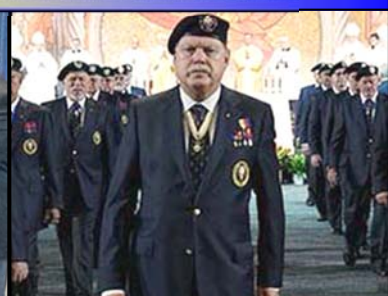
The new 4 th Degree Honor Guard Regalia was unveiled.