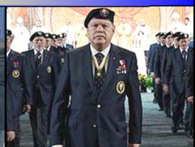
The new 4 th Degree Honor Guard Regalia was unveiled.