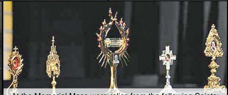
At the Memorial Mass were relics from the following Saints: Louis, Faustina Kowalska, John Paul II, Mexican Martyrs, and Teresa of Calcutta