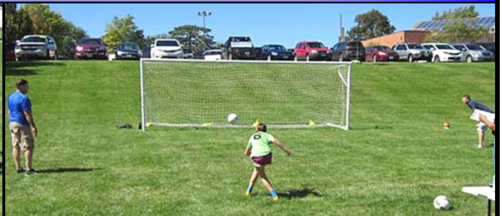
This was the first year our council hosted the Knights Soccer Challenge which we did in conjunction with the Family Fun Fest.