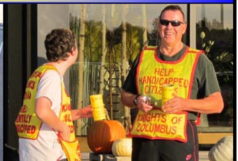
We raised a total of $1,448.52 during our annual Drive for Persons with Developmental Disabilities.