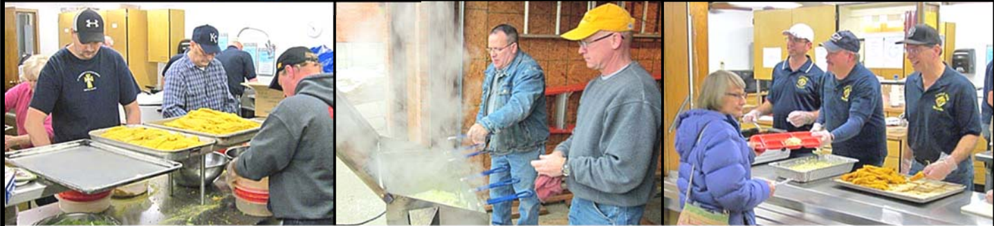
Coating, Frying, and Serving up our tasty Fish - The only thing we DON'T do is catch it!