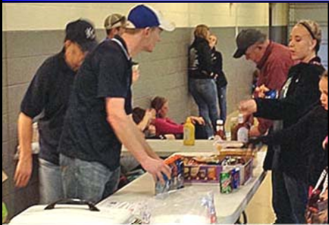
Concessions were always busy