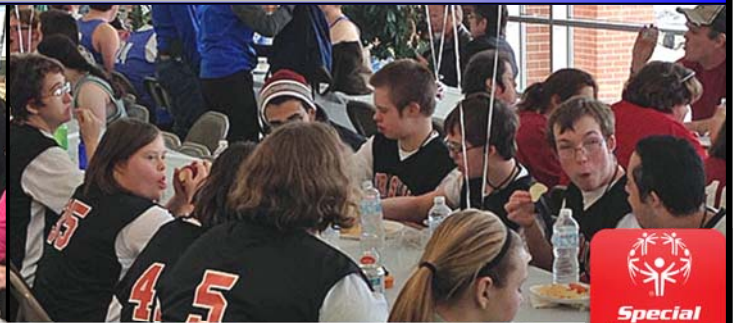
Serving Lunch for Athletes and Coaches at the SOMO Basketball Tournament at Bearcat Arena