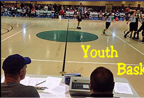
View from the Scorer's Table