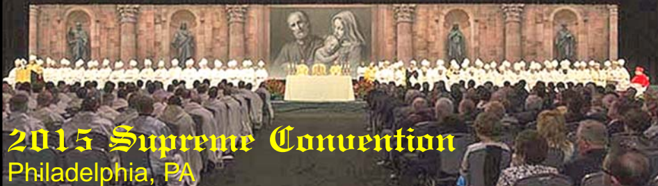
2015 Supreme Convention Philadelphia, PA