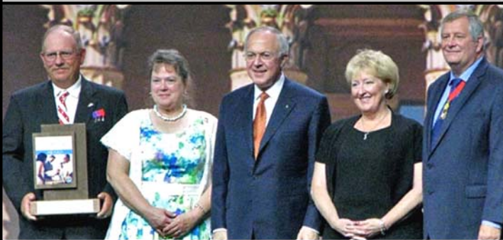
Martinsburg Council Won the International Family Activity Award