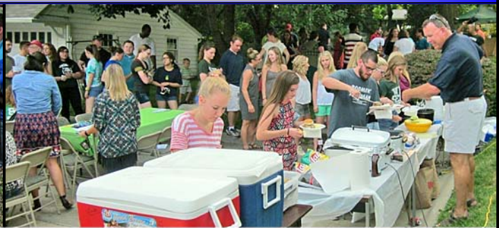
Newman Students attending "Mass in the Grass" on the Sunday prior to the start of classes were treated to our annual BBQ meal.