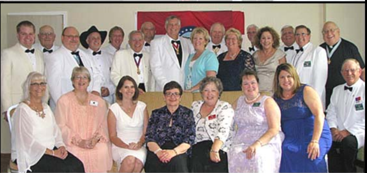
The Missouri Delegation Prior to the States Dinner