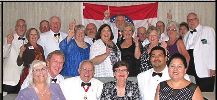
The Missouri Delegation Says We are Number 1 in the Order!