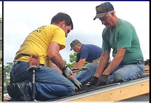
Once again our Council Shingled the Habitat House Built in Nodaway County