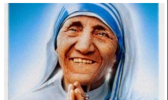
St. Mother Teresa

If we pray, we will believe; If we believe, we will love; If we love, we will serve.