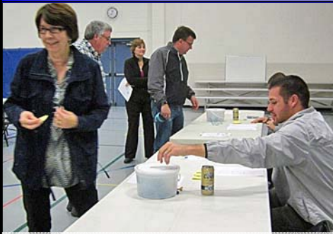
Sales were Brisk for Race Tickets