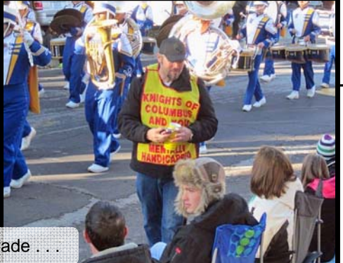
... Saturday Morning at the Northwest Homecoming Parade ...