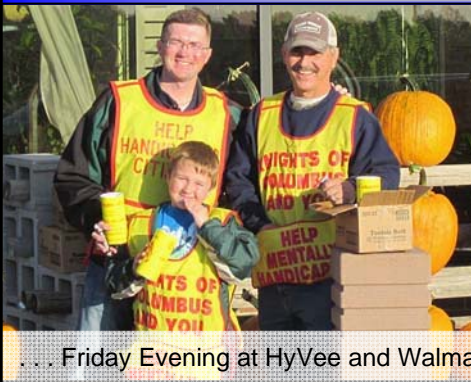
... Friday Evening at HyVee and Walmart ...