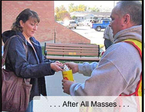
... After All Masses ...