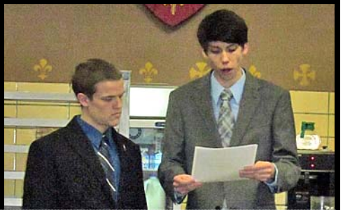
Entertainment was provided by several very talented seminarians