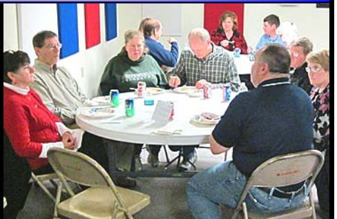
Everyone enjoys a nice meal and some time to talk.