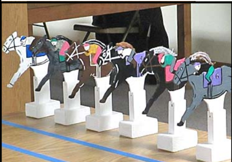
The Horses are ready at the Gate!