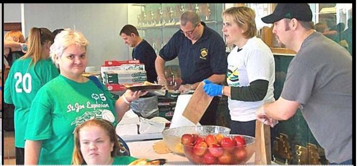
Serving Lunch at the Special Olympics Basketball Tournament held at NWMSU